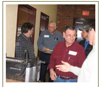
Additional pictures from our March 1 st Club Meeting.