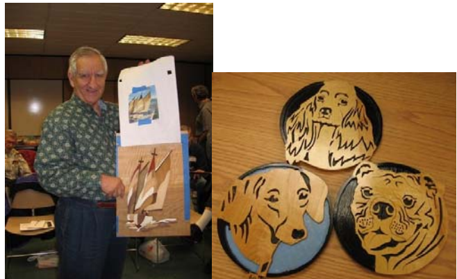
Walt England made this intarsia sailboat picture and these scroll saw dogs.