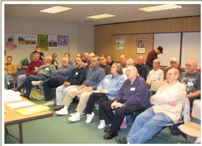
More than 40 people attended our last meeting.