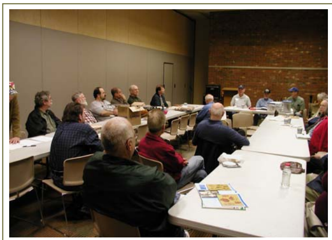
We regularly get good attendance at our monthly meetings.