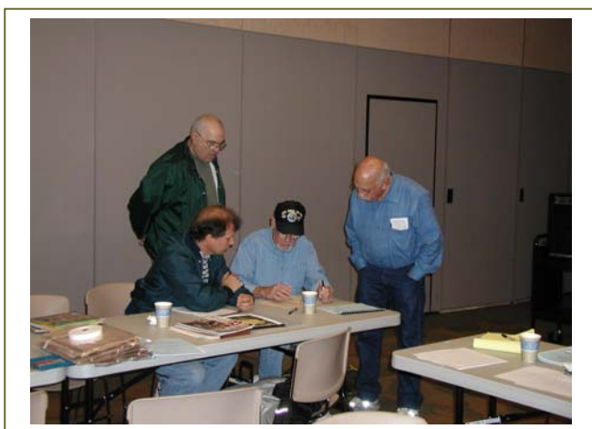
There is always ample time to ask questions and get advice.