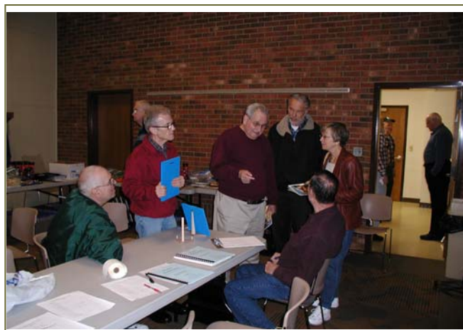
Mixing and mingling during the mid-meeting break to pick out needed materials and/or have some refreshments and conversation.

Our group is a Chapter of the American Marquetry Society