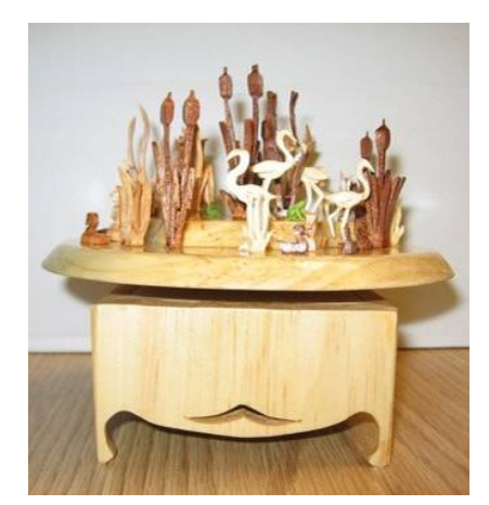
Ethel Autorino -Miniature Musicbox