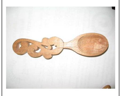
Pete Laudati- Spoon Carving