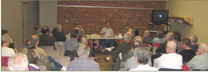
Photo from Video Viewing