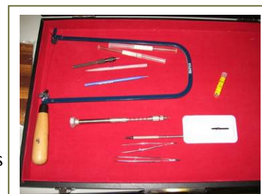
The Dr.'s Marquetry Tools