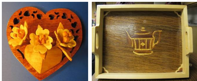
Walt Englad - 3D Heart with Flowers; Marquetry Tray