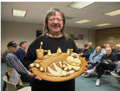
Pat Miles - Cat in Sink Intarsia