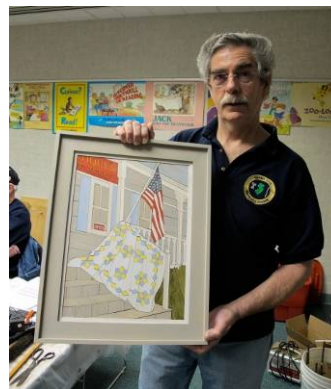
Charlie Brainard - Antique Shop with Flag - Lath Art